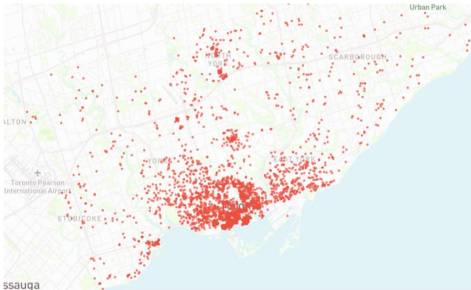
Figure 2: Recently and frequently listed entire homes for rent on Airbnb, August 18

During the pandemic, Airbnb activity appears to have become even more concentrated in these two neighbourhoods. Looking only at active ghost hotels - entire homes/apartments that are highly available, frequently and recently reviewed iii - we see the Waterfront Communities and Niagara account for 1,404 of the 3,800 such listings currently operating citywide, or 37%. iv Most of these listings (820 of 1,404) were, moreover, offered by multi-listing hosts, host that are in violation of Toronto's short-term rental rules. v